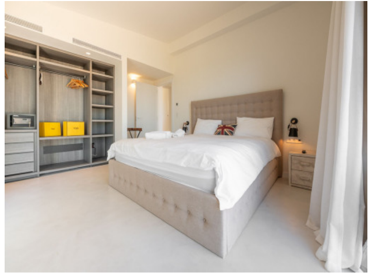
A total of 6 bedrooms