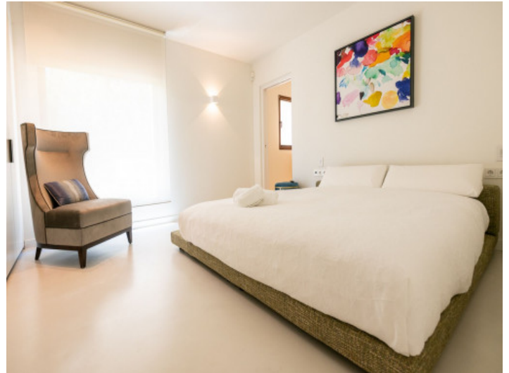
One of 6 bedrooms