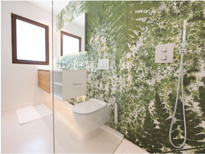
Bathroom en suite