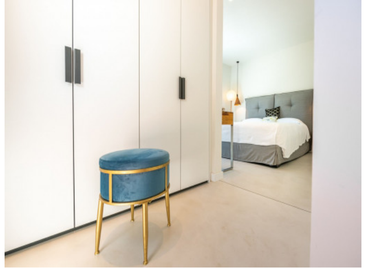
Mastersuite with dressing area and bathroom