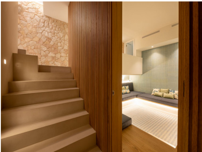
Entrance to the home cinema