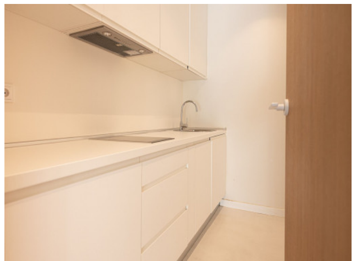
Kitchen guest area

All information is correct to the best of our knowledge. Errors and prior sale excepted. This prospectus is purely for information purposes. Only the notarized deed of sale is legally binding.