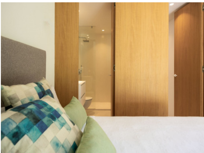
Bedroom guest area