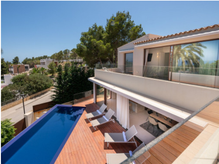
View from the first floor