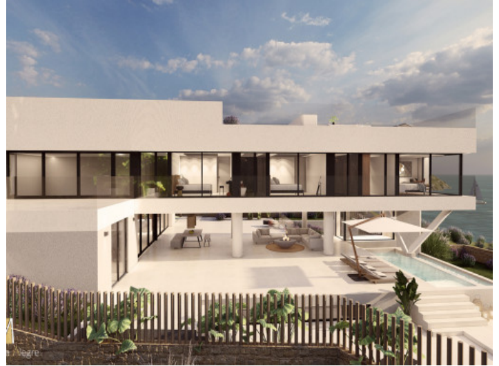
High quality construction