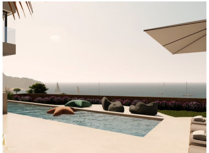
Stunning pool area