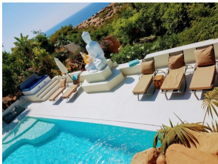
Views to the pool area

All information is correct to the best of our knowledge. Errors and prior sale excepted. This prospectus is purely for information purposes. Only the notarized deed of sale is legally binding.