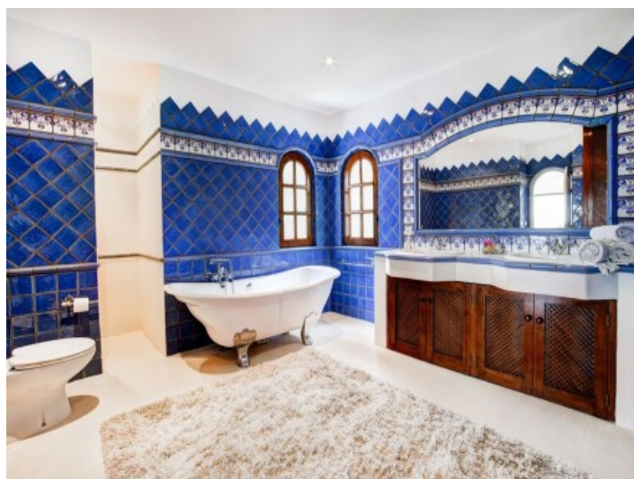
Elegant bathroom with bath tub