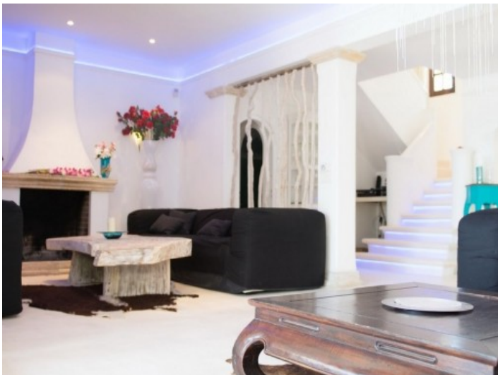
Alternative view of the living area with fireplace