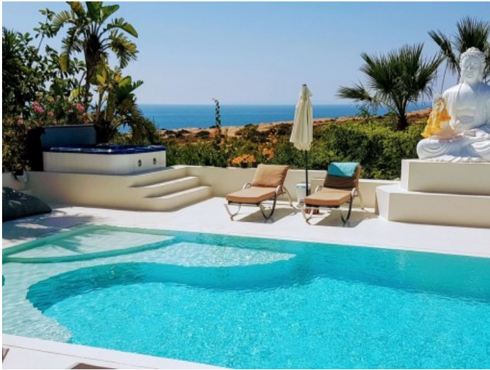
Splendid sea views of the villa