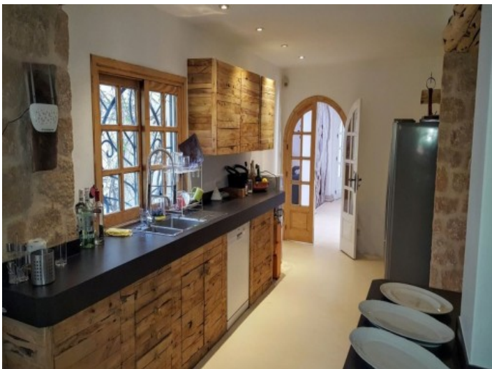
Fantastic cooking island