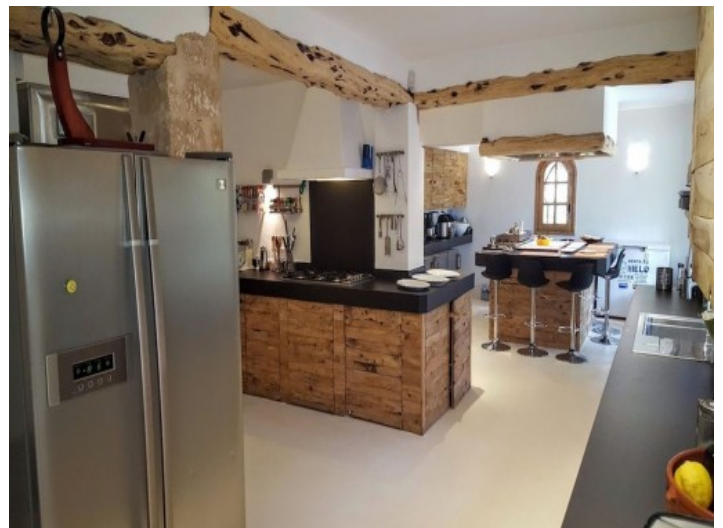
Alternative view of the kitchen

All information is correct to the best of our knowledge. Errors and prior sale excepted. This prospectus is purely for information purposes. Only the notarized deed of sale is legally binding.