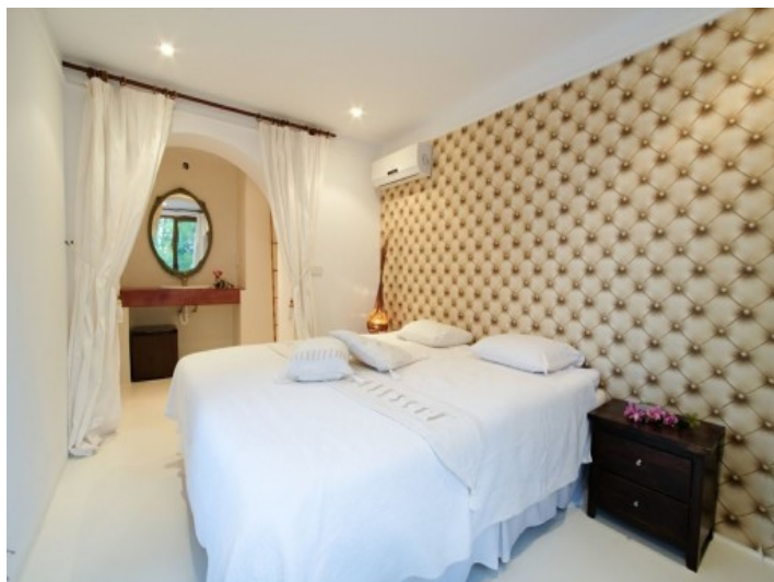
Elegant master bedroom with double bed