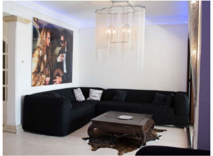
Noble living area