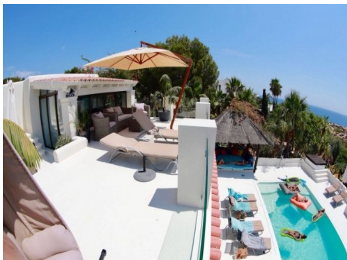
Impressive balcony of the villa