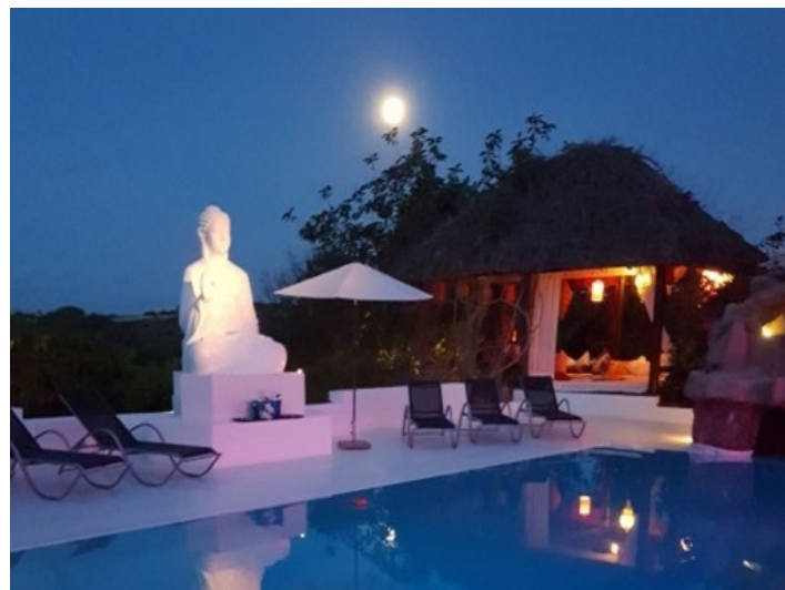
The pool area by night

All information is correct to the best of our knowledge. Errors and prior sale excepted. This prospectus is purely for information purposes. Only the notarized deed of sale is legally binding.