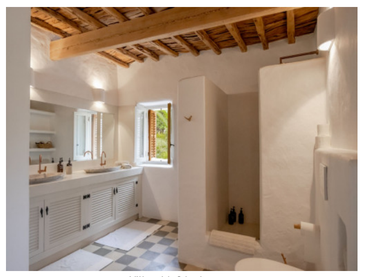
Villa with 8 bathrooms