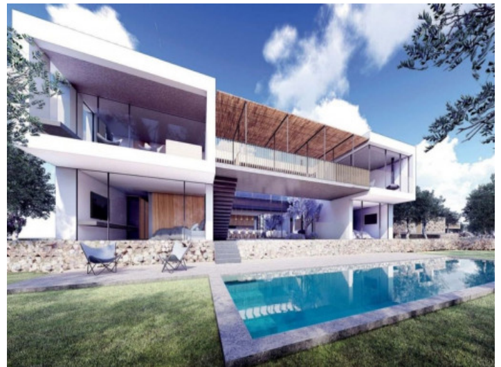
Exterior view with pool