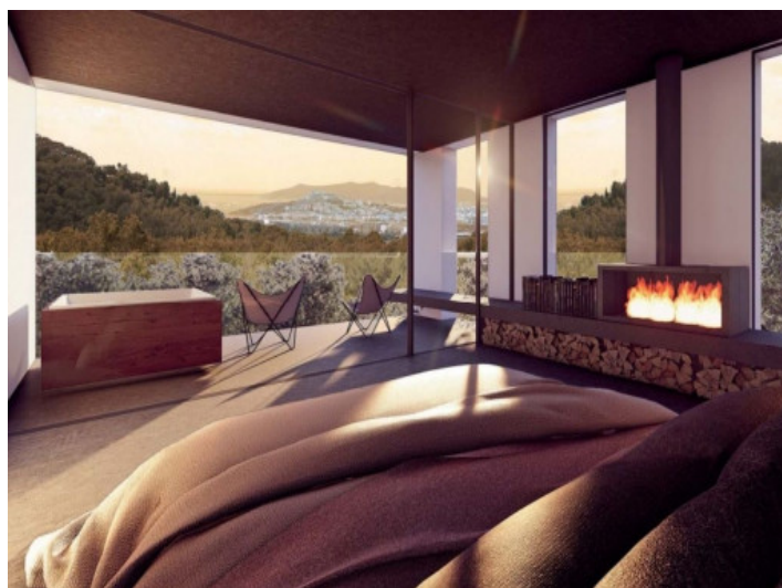
Bedroom with views to Dalt Vila