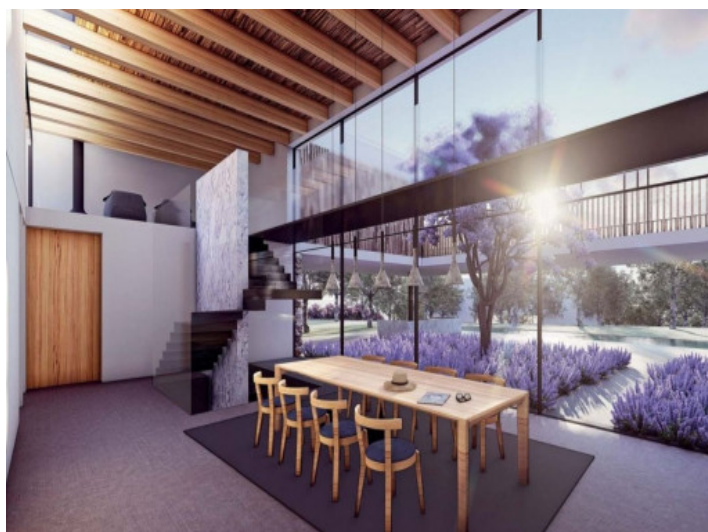
Light flooded dining and living area