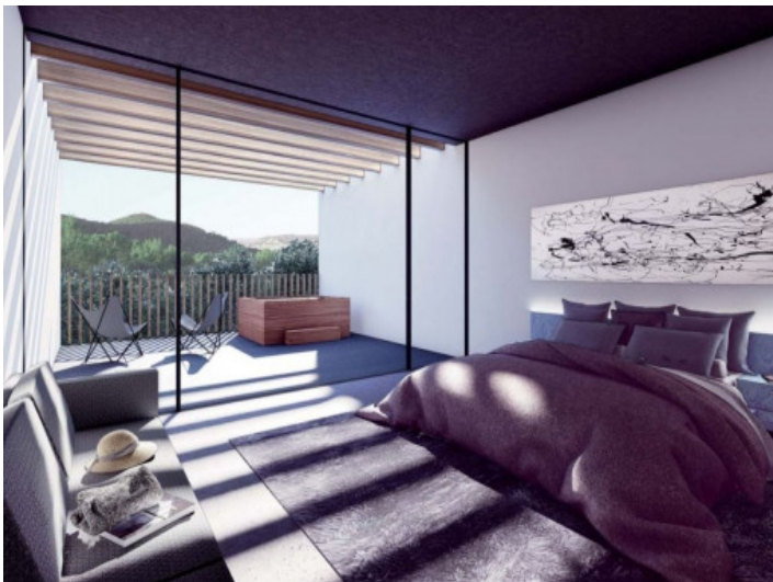
Panoramic windows of the villa