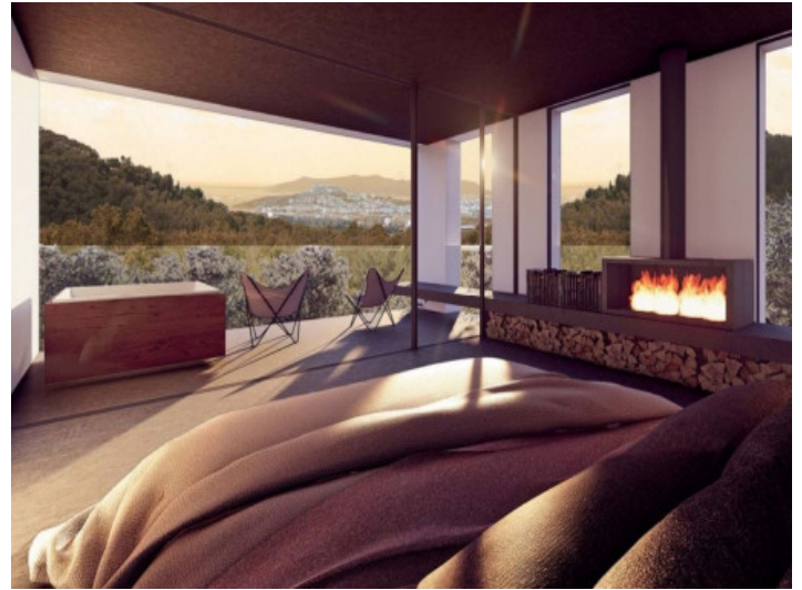
Bedroom with views to Dalt Vila