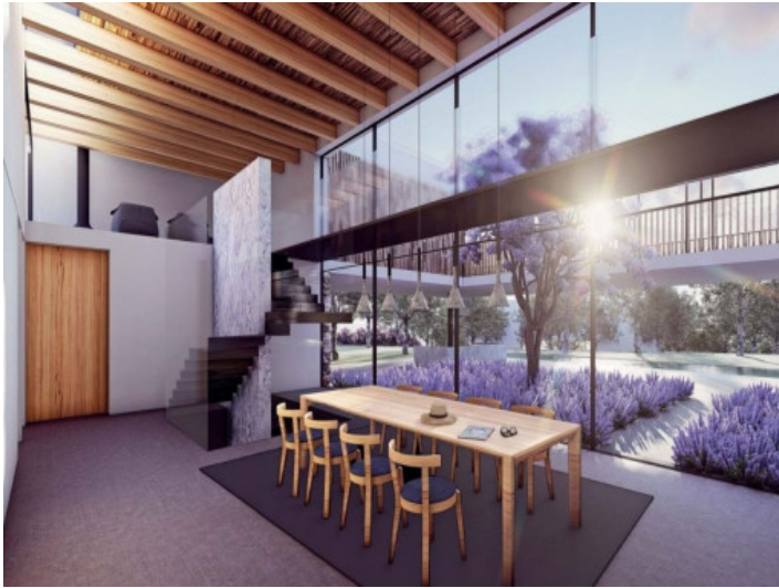
Light flooded dining and living area