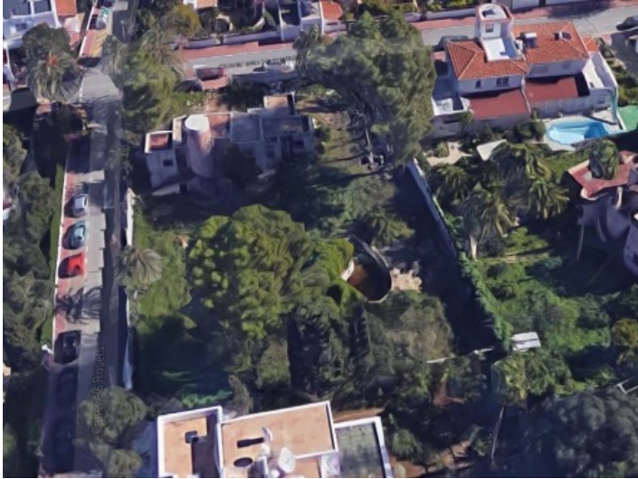
Views of the property