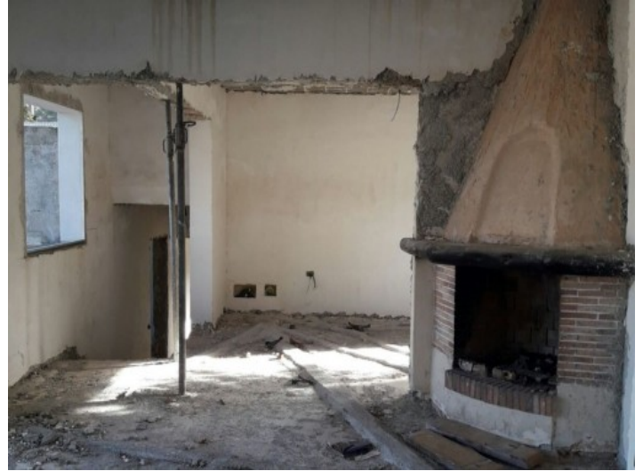
Living area with fire place