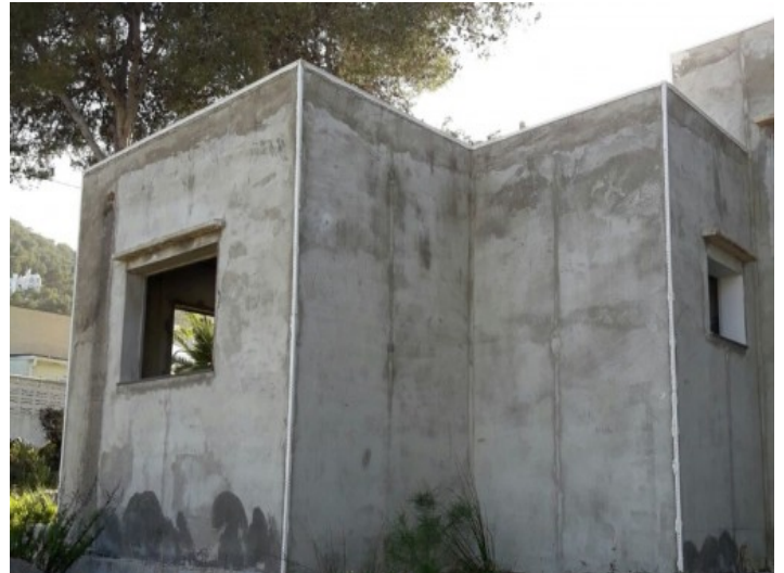
Alternative view of the property

All information is correct to the best of our knowledge. Errors and prior sale excepted. This prospectus is purely for information purposes. Only the notarized deed of sale is legally binding.