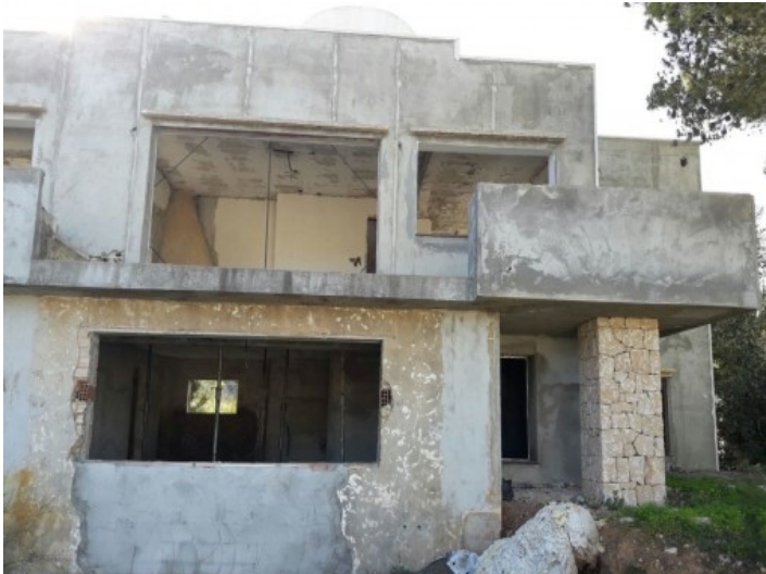
Exterior view of the property