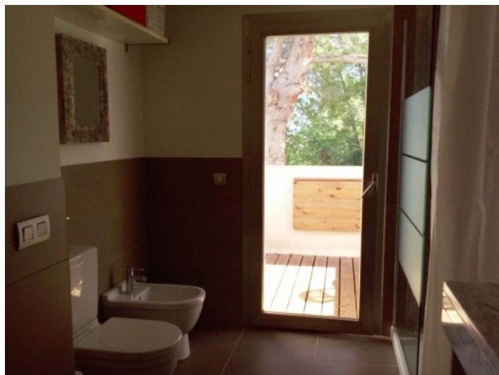
Bathroom en suite with shower