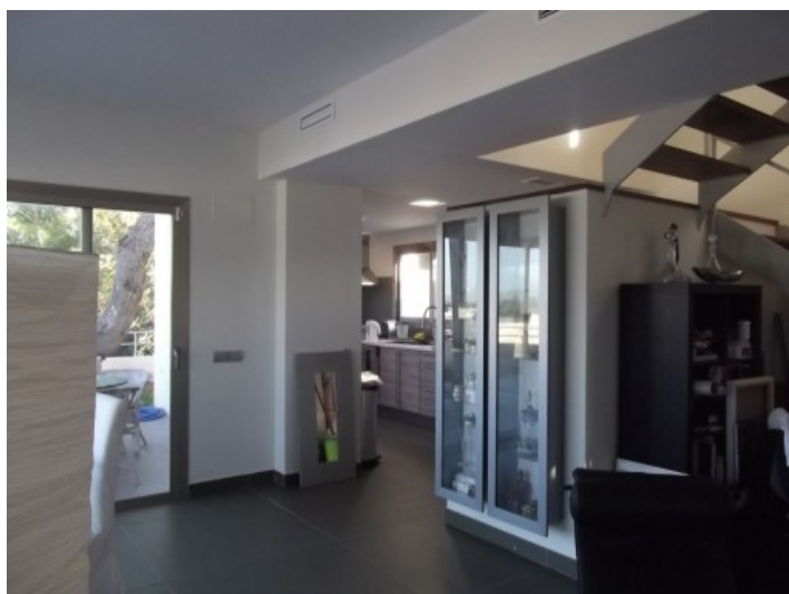
Views to the kitchen