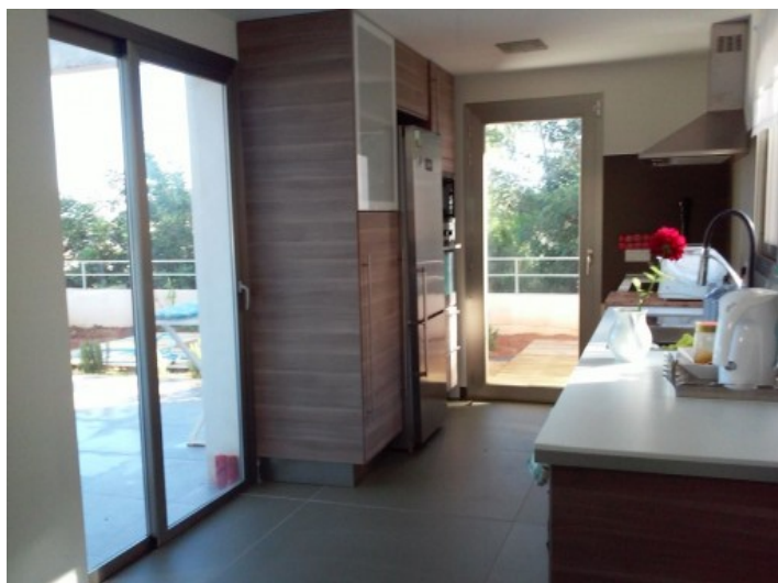
Alternative view of the kitchen