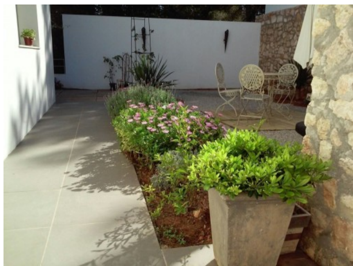
Alternative garden view