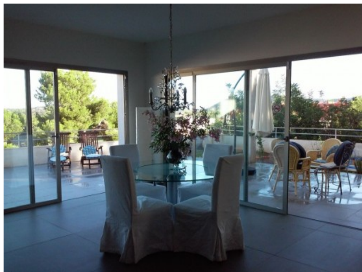
Dining area with terrace access