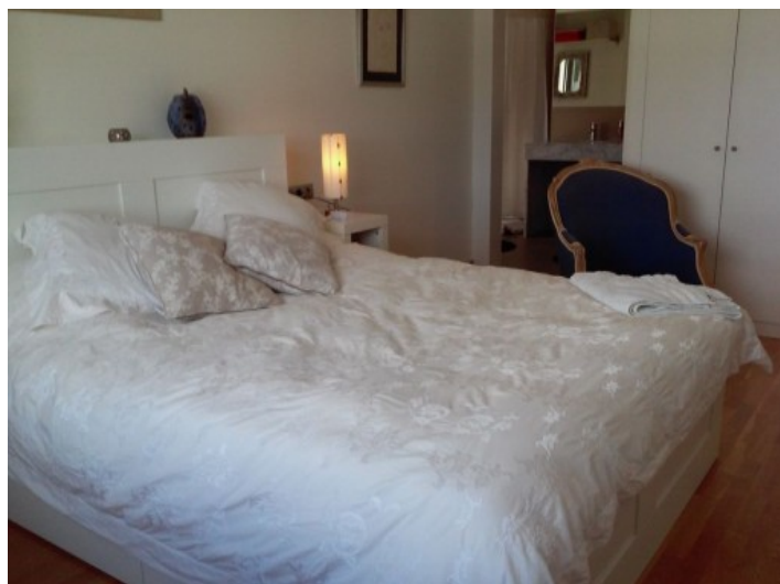
Spacious master bedroom

All information is correct to the best of our knowledge. Errors and prior sale excepted. This prospectus is purely for information purposes. Only the notarized deed of sale is legally binding.