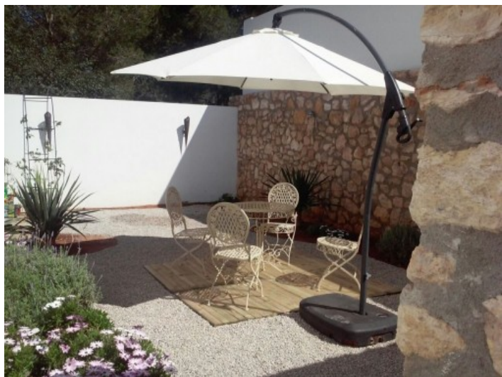
Inviting garden area