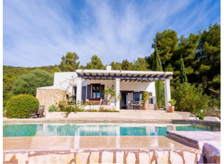
To fall in love