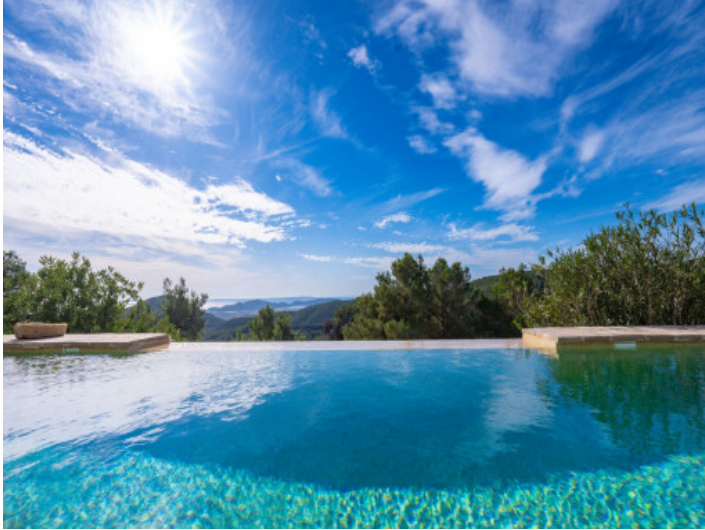
A very special place