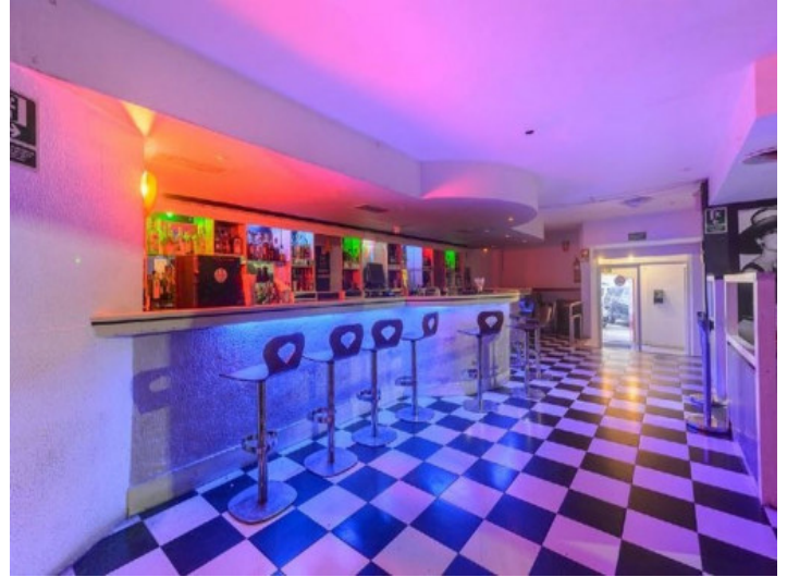
One of 3 bars