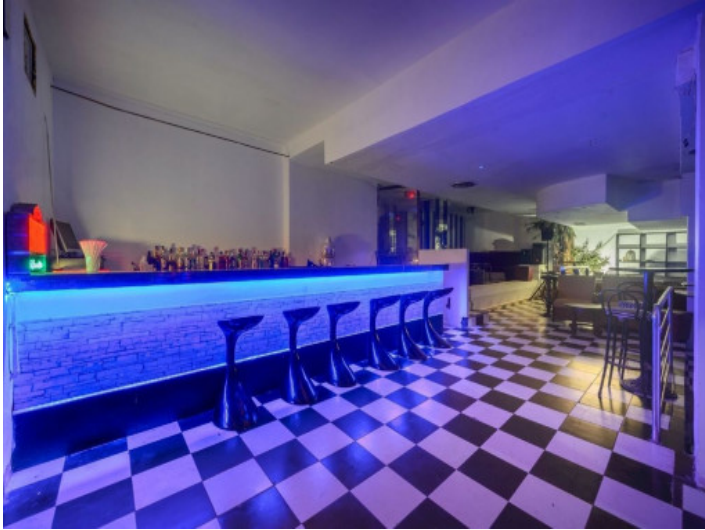
One of 3 bars