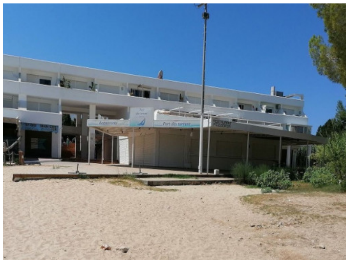
Exterior view of the restaurant