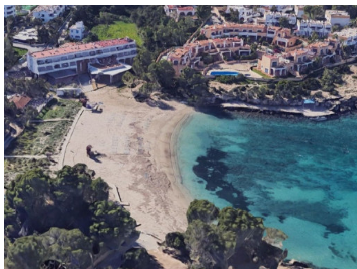
View of the beach

All information is correct to the best of our knowledge. Errors and prior sale excepted. This prospectus is purely for information purposes. Only the notarized deed of sale is legally binding.