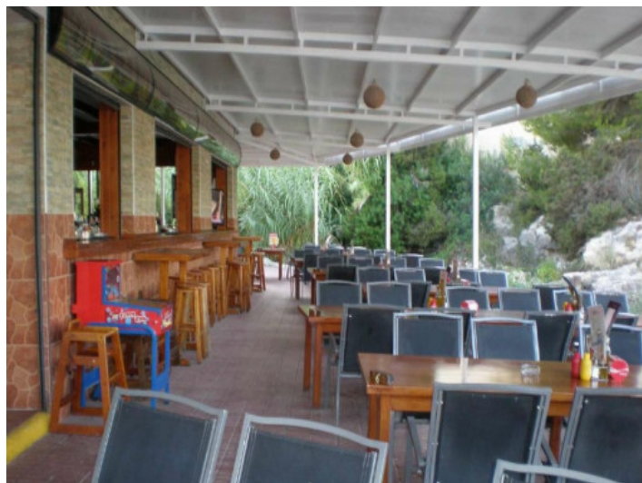
Covered dining area