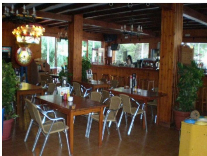
Interior dining area