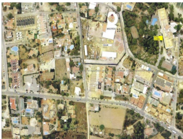
Plot for a club on Ibiza

All information is correct to the best of our knowledge. Errors and prior sale excepted. This prospectus is purely for information purposes. Only the notarized deed of sale is legally binding.