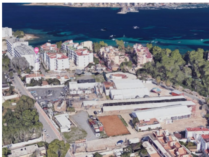
Plot for a club on Ibiza