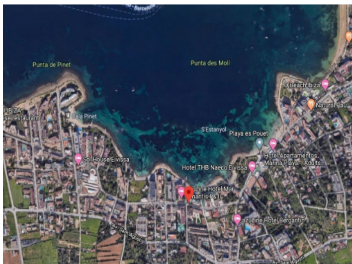
Plot for a club on Ibiza