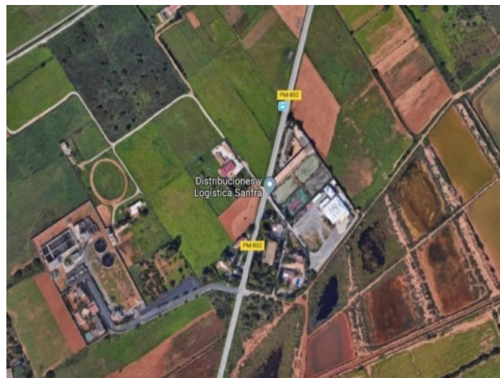
The property comes with pool and 4 tennis courts