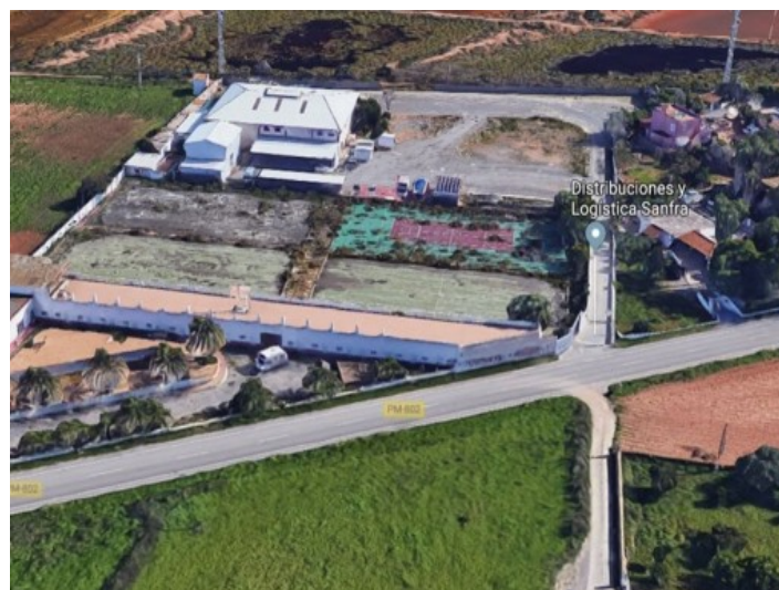
Alternative view of the property

All information is correct to the best of our knowledge. Errors and prior sale excepted. This prospectus is purely for information purposes. Only the notarized deed of sale is legally binding.