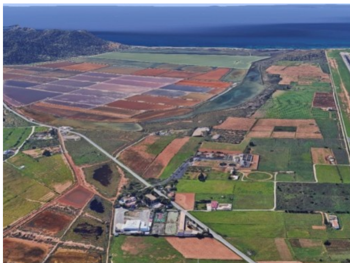
Views of the surroundings