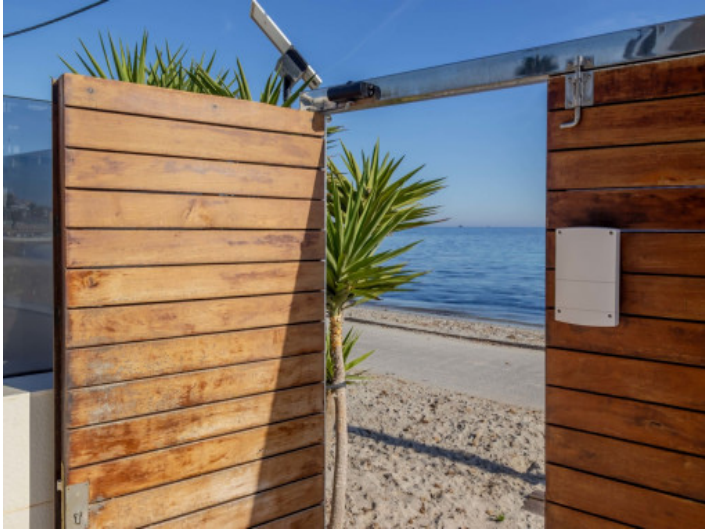
Access to the beach