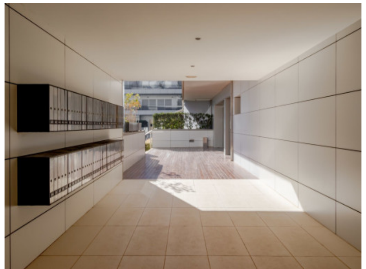
Entrance hall of the building

All information is correct to the best of our knowledge. Errors and prior sale excepted. This prospectus is purely for information purposes. Only the notarized deed of sale is legally binding.