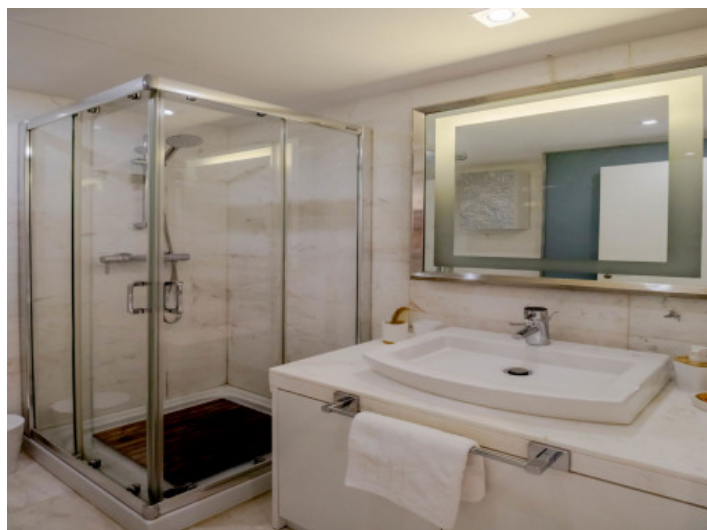
Appartment with 2 bathrooms

All information is correct to the best of our knowledge. Errors and prior sale excepted. This prospectus is purely for information purposes. Only the notarized deed of sale is legally binding.