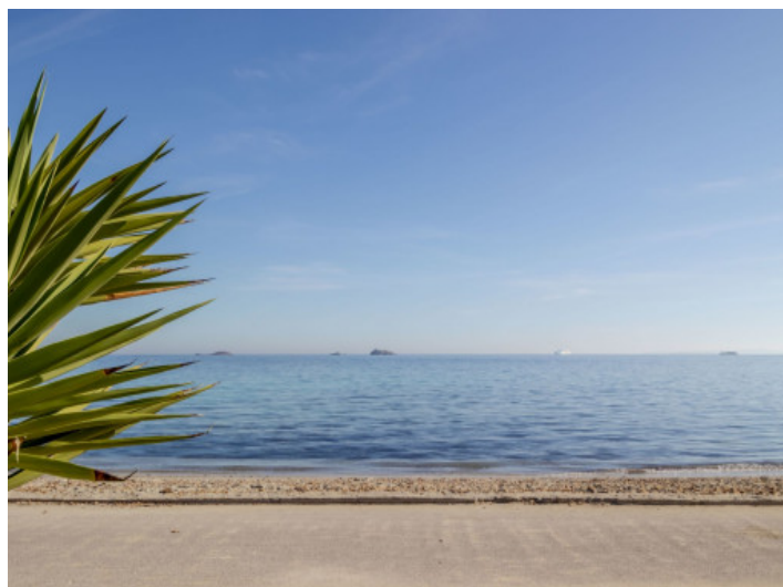
Beach in front of the door

All information is correct to the best of our knowledge. Errors and prior sale excepted. This prospectus is purely for information purposes. Only the notarized deed of sale is legally binding.