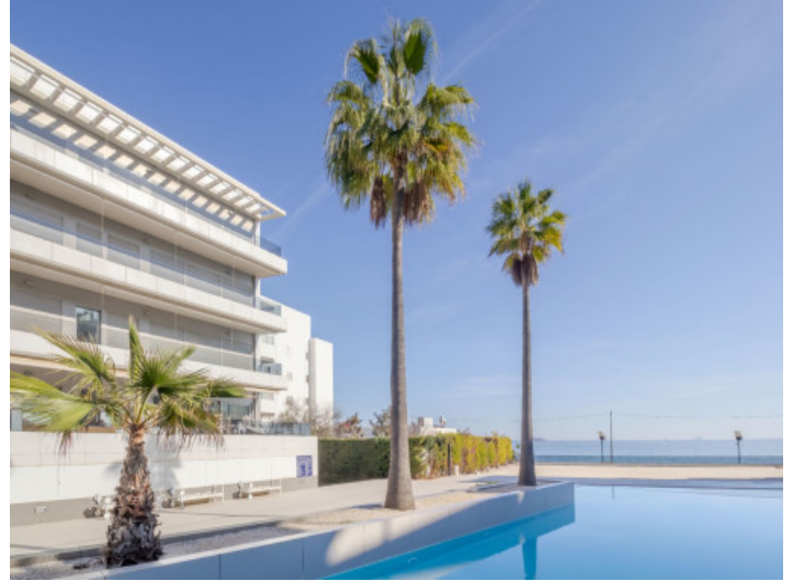
Community pool in front of the beach