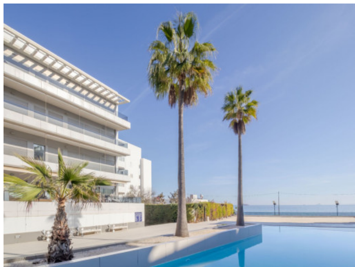
Community pool in front of the beach