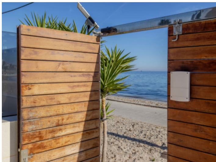
Access to the beach