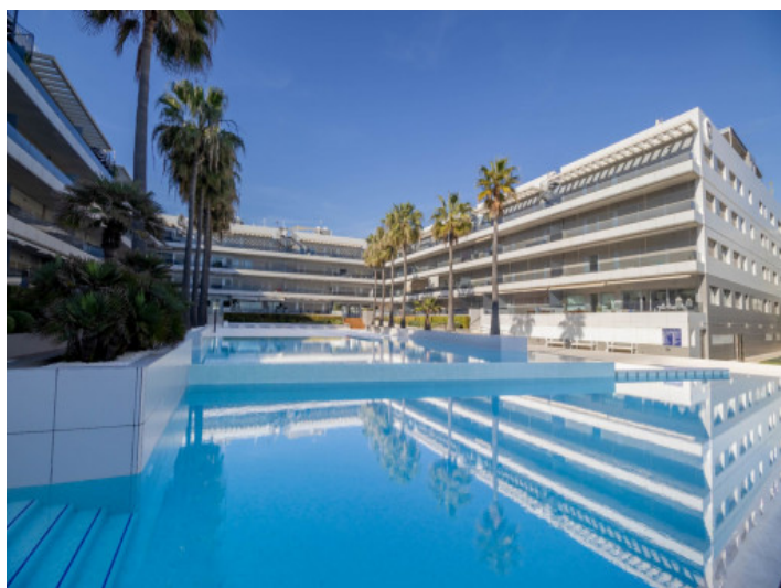
View to the complex