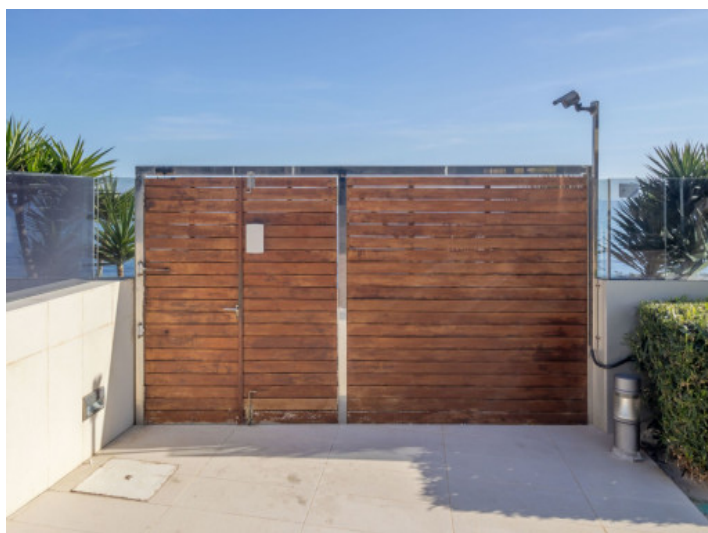
Access to the beach