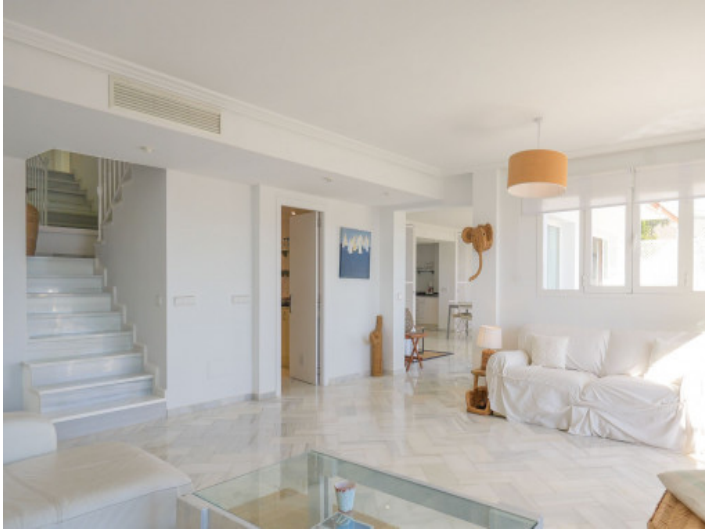
Living area with staircase to the upper floor