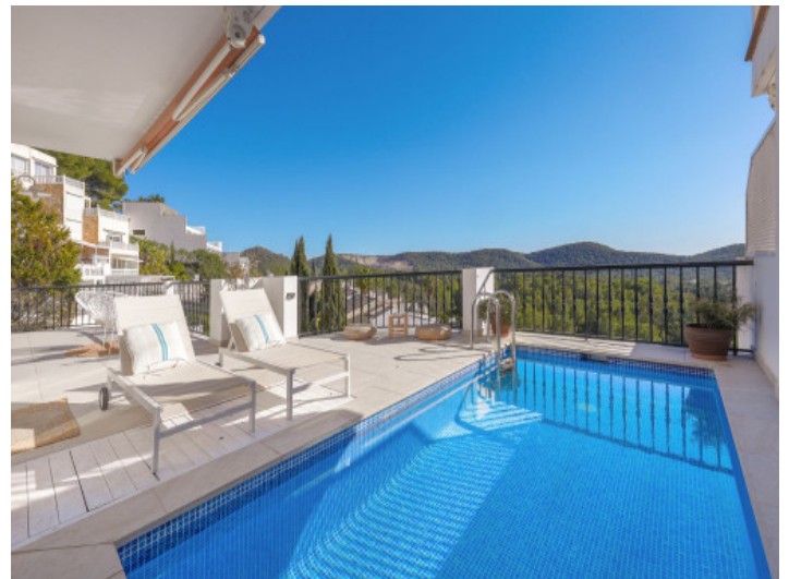
Beautiful private pool