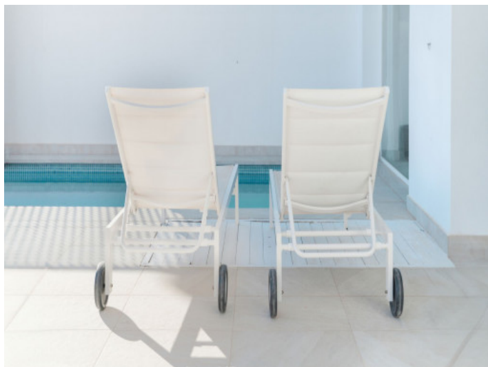
Enjoy and relax