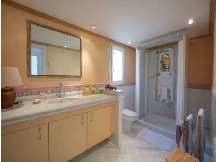
One of 6 bathrooms