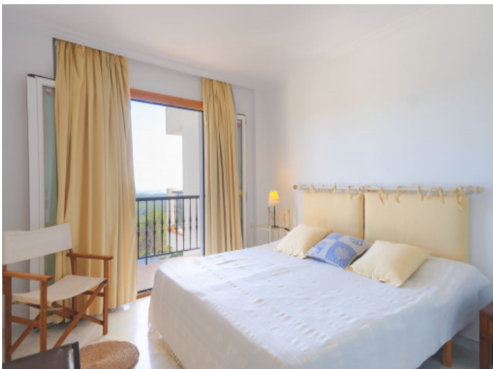
Bedroom with french balcony