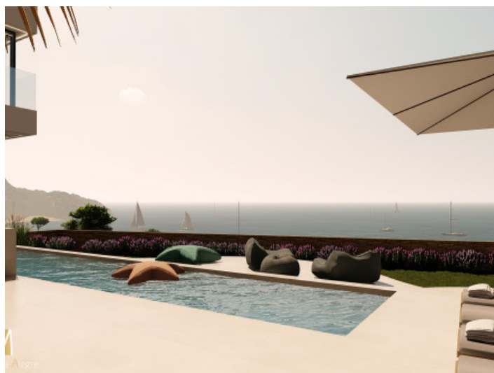
Stunning pool area