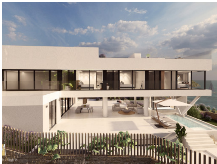
High quality construction